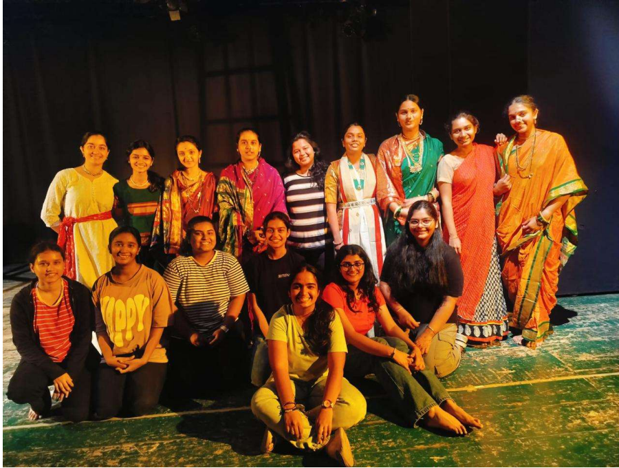
THE BNCA TEAM